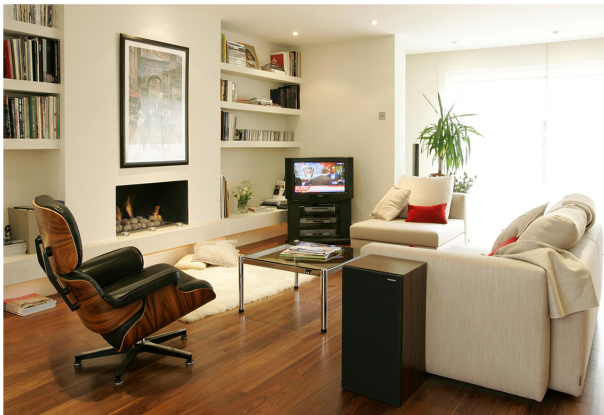
Above: The extended living area has a modern 'loft style'.

In only eight months and with the help of Mitchell's Complete Building Services, the project's unusual challenges were gradually overcome. The design concept hinged upon the construction of large open areas and the ability to bridge spaces with a minimum amount of walls. "Fortunately the builder rose to the occasion and we were able to educate the various tradesmen with the final solutions we wanted to achieve for