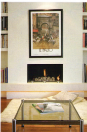
The modern gas fire forms the focal point of the living room

garden, explains Carmen "Whilst the garden is well established with some attractive plants and mature trees, we still feel that there is some room for improvement. We are currently looking for professional advice in this area and therefore hope that complete integration can be achieved through wise selection of ornamental plants, contemporary lighting and modern garden furniture." ■