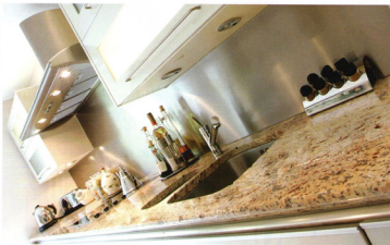
The kitchen doesn't rely on a more expected triangular formation, but still works exceptionally well.